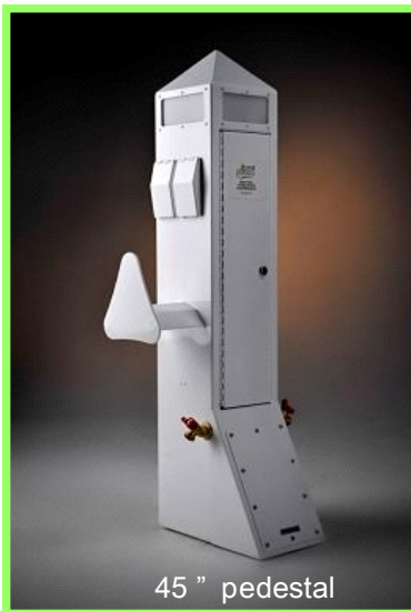
45 " pedestal