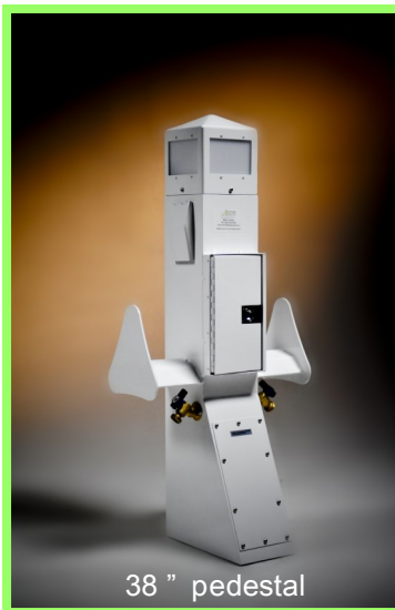
38 " pedestal